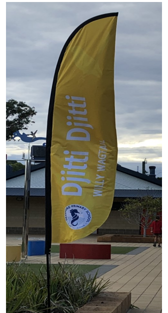
Our School Values and Faction Flags.

EDU Dance Concert —The EDU Dance concerts are scheduled for Thursday 27th June and Tuesday 2nd July, commencing at 2:20pm. You are invited to attend. Please see attached page for when your child's class will be participating.